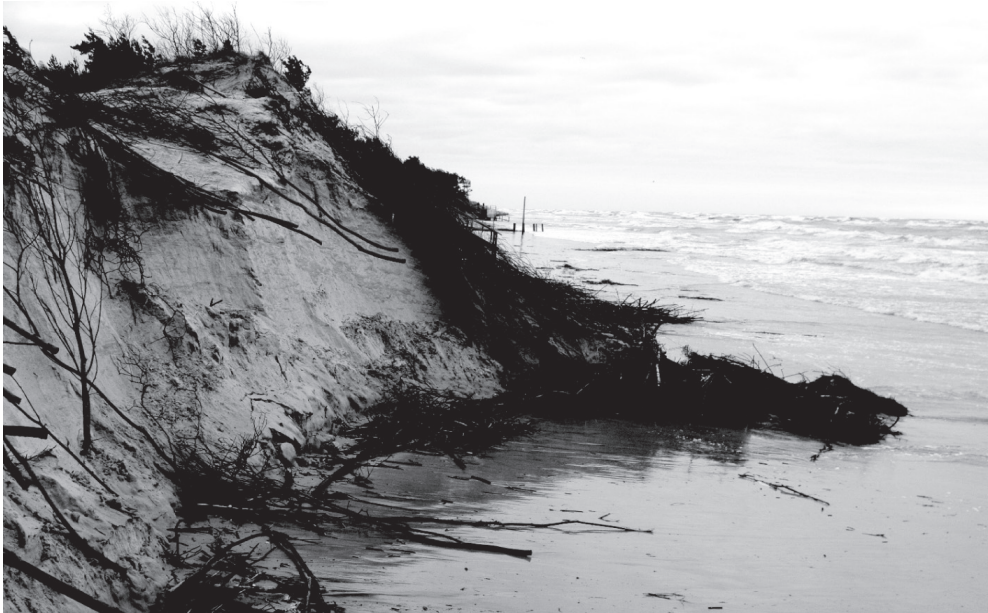
Figure 2b. The dunes of Palanga after repeating strong winds

The long-term principle concept is guided by the use of local resources; responsible socio-economic commitments to the possible strategic choices and alternatives, taking into consideration the probabilities of failure; use of various protective measures and technologies; and a vision for multiple timelines according to sustainable development.