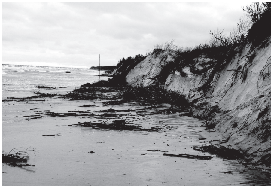
Figure 2a. The beaches of Palanga after repeating strong winds

The model of long-term principles can be realistically actualized into strategies for environmental protection and integrated coastal zone management. But unemployed principal concept such long-term practises are enacted, natural resources such as the dunes on the beaches of Palanga (resort of the Baltic Sea, near Klaipėda Sea Port in Lithuania) were damaged by erosion again. Photographs in Figures 2a and 2b show the devastation of erosion following a repeating strong winds (photo by Andrius Pelakauskas).