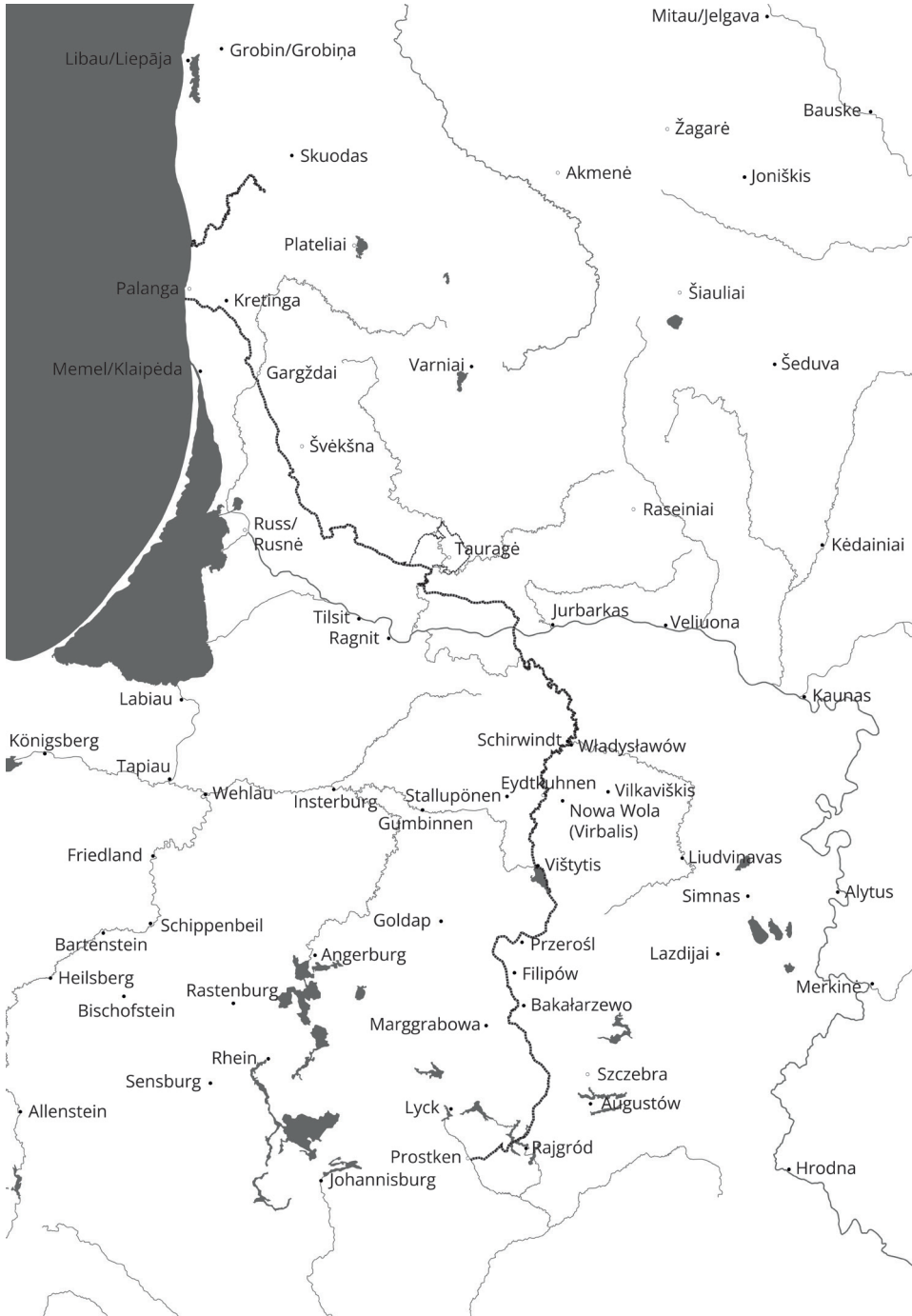
Figure 1. The map shows two stretches of the border between Lithuania and the domains of the Teutonic Order in Prussia and Livonia. The shape of the border was roughly defined by the Treaty of Melno. The map also indicates many locations mentioned in the introductory article. © Vasilijus Safronovas, 2025