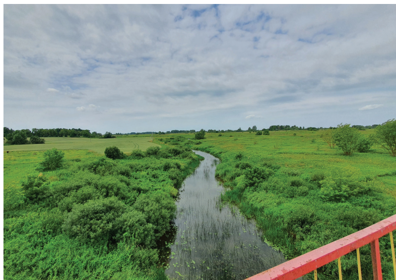
Figure 6. The Schirwindt/Širvinta River – a natural dividing line established in 1422 between Lithuania and Prussia, which today still separates Lithuania and the European Union from Russia. View from the bridge in Kudirkos Naumiestis. Photo: Vasilijus Safronovas, 2023.