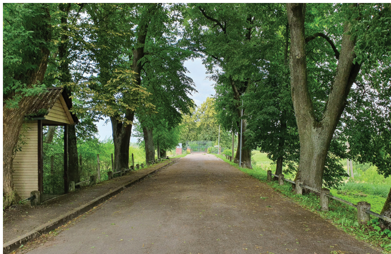
Figure 5. The old road across the border that once connected Kudirkos Naumiestis (formerly Władysławów) in Lithuania and Schirwindt in Prussia.