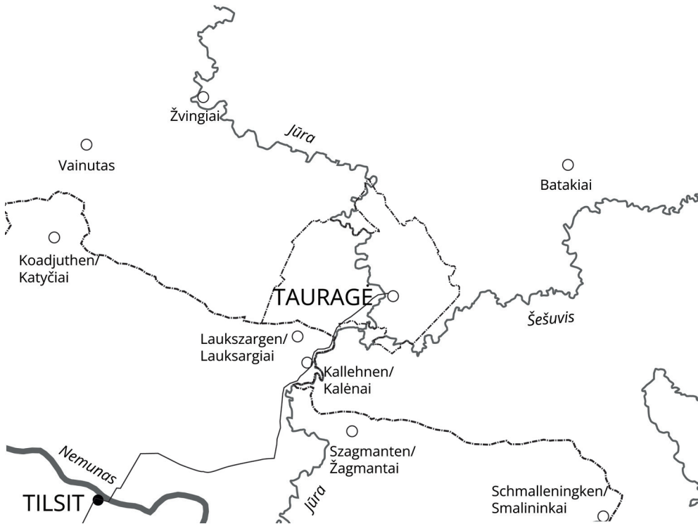
Figure 3. Map of the Tauragė nexus of interaction before 1830. The black dot marks the town, while circles indicate other important settlements (towns, villages). The dot-dashed lines show the border between Lithuania and Prussia and the boundaries of the Tauragė estate, while the solid line marks the land route from Tauragė to Tilsit in the 18th century. © Vasilijus Safronovas, 2025

began to change. In 1785 it was still a small royal village with 15 hearths. The establishment of a post station in 1833 marked the beginning of its transformation. 73