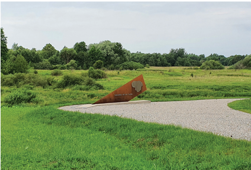
Figure 8. A sign in Kudirkos Naumiestis commemorating the 600th anniversary of the Treaty of Melno (architect Mantas Paketuris; manufactured by Andrius Vencius). Photo: Vasilijus Safronovas, 2023.