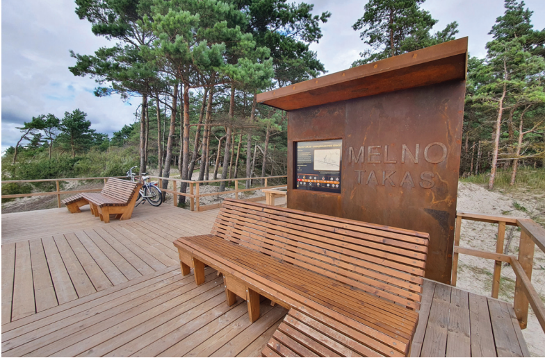
Figure 7. Information about the Treaty of Melno on a walking trail for visitors, installed by Palanga Municipality on the Baltic Sea coast in 2025.