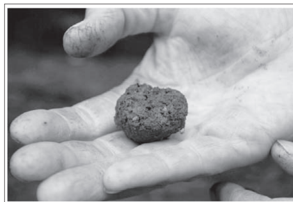
Fig. 2. Coprolite from the Beregovaya 2 site (the Urals, Stone Age, about 7500 BC).

A well-preserved coprolite was excavated recently at the Beregovaya 2 site, one of the rare Stone Age bog sites in the Urals region with excellent preservation conditions for organic material. The ZBSA gene lab conducted a study to determine the species of origin