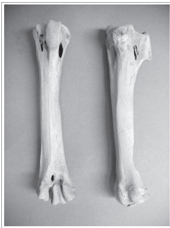
Fig. 4. Pelican bones ( Pelecanus crispus ) from the Rosenhof Mesolithic site in northern Germany (about 4600 BC).

In summary, genetic analyses of archaeological bone plates show the Holocene distribution of sturgeons