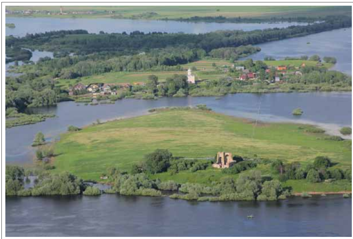
Fig. 2. A view (from the west) of the central part of Rurikovo Gorodishche during the spring flooding of the Volkhov. In the foreground are the ruins of the Church of the Annunciation on Gorodishche (twelfth century). In the background is the Church of the Saviour on Nereditskiy Hill (photograph from E.N. Nosov's collection).

a special group of burial monuments in Eastern Europe from the final Early Middle Ages, which, as little as 30 years ago, were practically unknown. The first discoveries (e.g. excavations of the Udray-2 cemetery in the Novgorod Oblast in 1981–1983) (Platonova-Zalevskaya 1983; Platonova 1998) seem to be unique, with no parallels. Now evidence of this kind has already been accumulated, as is shown by the review of the problem of Old-Rus' 'quasi-chambers' in the book by Mikhaylov. The task of Russian archaeologists is to summarise and to publish these materials, so that they become available for competent comparative analysis.