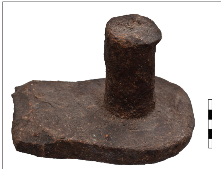
Fig.13. Structural detail (M.K. Čiurlionis National Museum of Art, Inv. No. Tt-4423).

similar to the trapezoidal form, it differs from those found in the Crusaders' castles (e.g., Veliuona unnamed castles, KT type (Rimkienė 2019)). The head appears to be made from the same rod as the stem. The connection line at the border of the stem and the head was also overlooked, which would be an unusual practice in the castle's lifetime. The total length of the nail is 12 centimetres, stem thickness: 1 x 1 centimetres, head size 3.5 x 2.5 centimetres, head height 0.5 centimetres, weight 86 grams.