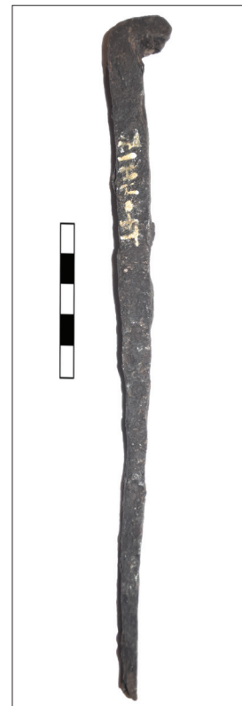
Fig. 12. Nail (M.K. Čiurlionis National Museum of Art, Inv. No. Tt-4415).

II FROM BONZE AGE TO MEDIEVAL: MATERIAL CUL- TURE AS A REFLECTION OF CHANGES IN SOCIETIES