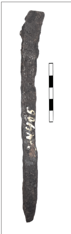
Fig. 4. Nail (M.K. Čiurlionis National Museum of Art, Inv. No. Tt-4405; photograph by E. Rimkienė).