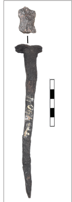
Fig. 3. Nail (M.K. Čiurlionis National Museum of Art, Inv. No. Tt-4404; photograph by E. Rimkienė).