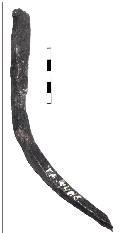
Fig. 5. Nail (M.K. Čiurlionis National Museum of Art, Inv. No. Tt-4406; photograph by E. Rimkienė).