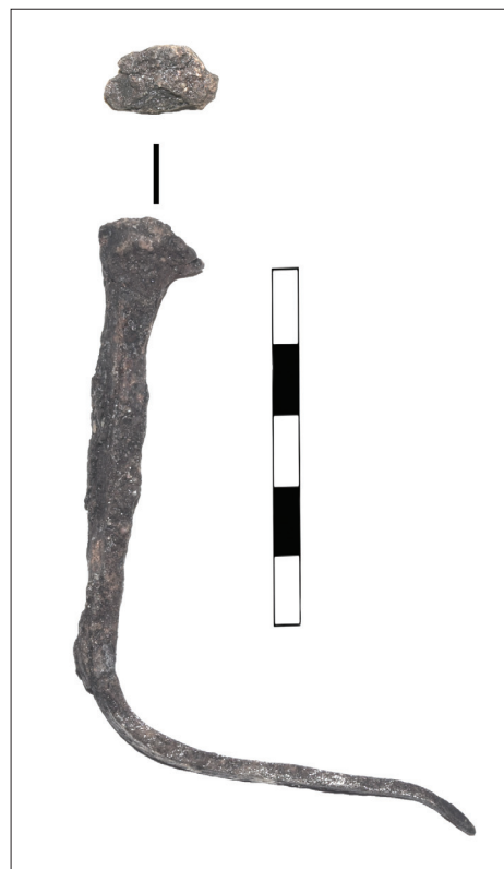
Fig. 9. Nail (M.K. Čiurlionis National Museum of Art, Inv. No. Tt-4410).