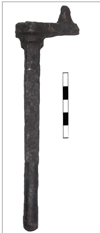
Fig. 11. Structural detail (M.K. Čiurlionis National Museum of Art, Inv. No. Tt-4414).