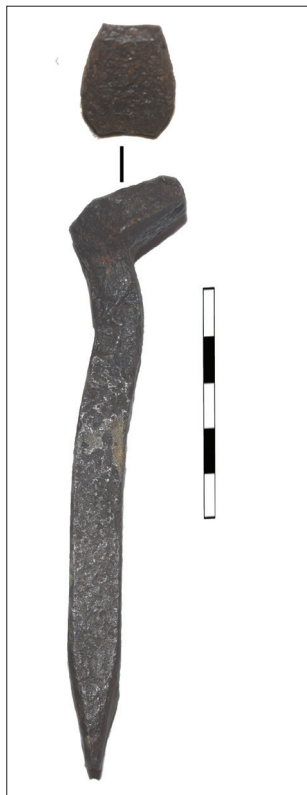
Fig. 10. Nail (M.K. Čiurlionis National Museum of Art, Inv. No. Tt-4413).