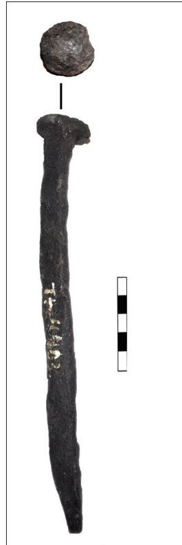
Fig. 2. Nail (M.K. Čiurlionis National Museum of Art, Inv. No. Tt-4403).