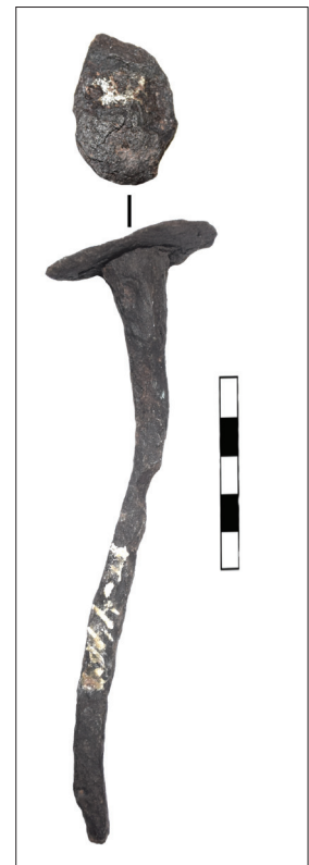
Fig. 6. Nail (M.K. Čiurlionis National Museum of Art, Inv. No. Tt-4407).