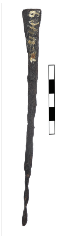
Fig. 8. Nail (M.K. Čiurlionis National Museum of Art, Inv. No. Tt-4409).