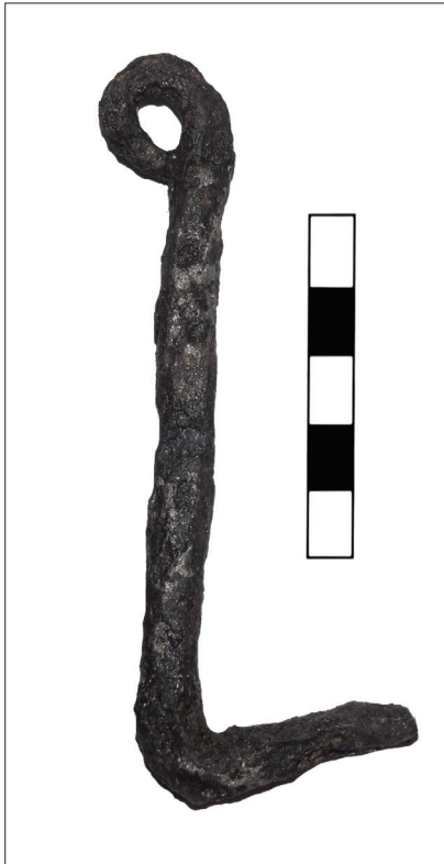
Fig. 1. Hook-nail (M.K. Čiurlionis National Museum of Art, Inv. No. Tt-4400).