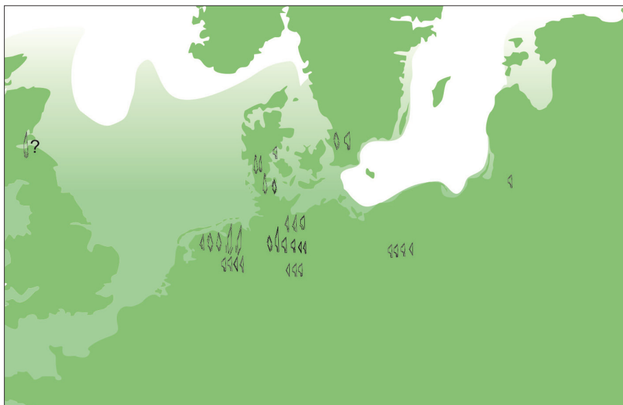
Fig. 3. Distribution of different Hamburgian shouldered/tanged points. Notice variability of forms in Northern German and Netherlands and homogeneity of set in western Poland.

importance of reindeer in Hamburgian subsistence strategies was confirmed not only by the discoveries from the Ahrensburg valley, but also by finds from the kettle hole in Slotseng, where exceptional direct evidence, in the form of a point pounded in reindeer bone, was found. However, the rare discoveries from the Mirkowice site suggest that Hamburgian economic strategies could be more elastic, consisting of fishing and small game hunting as well.