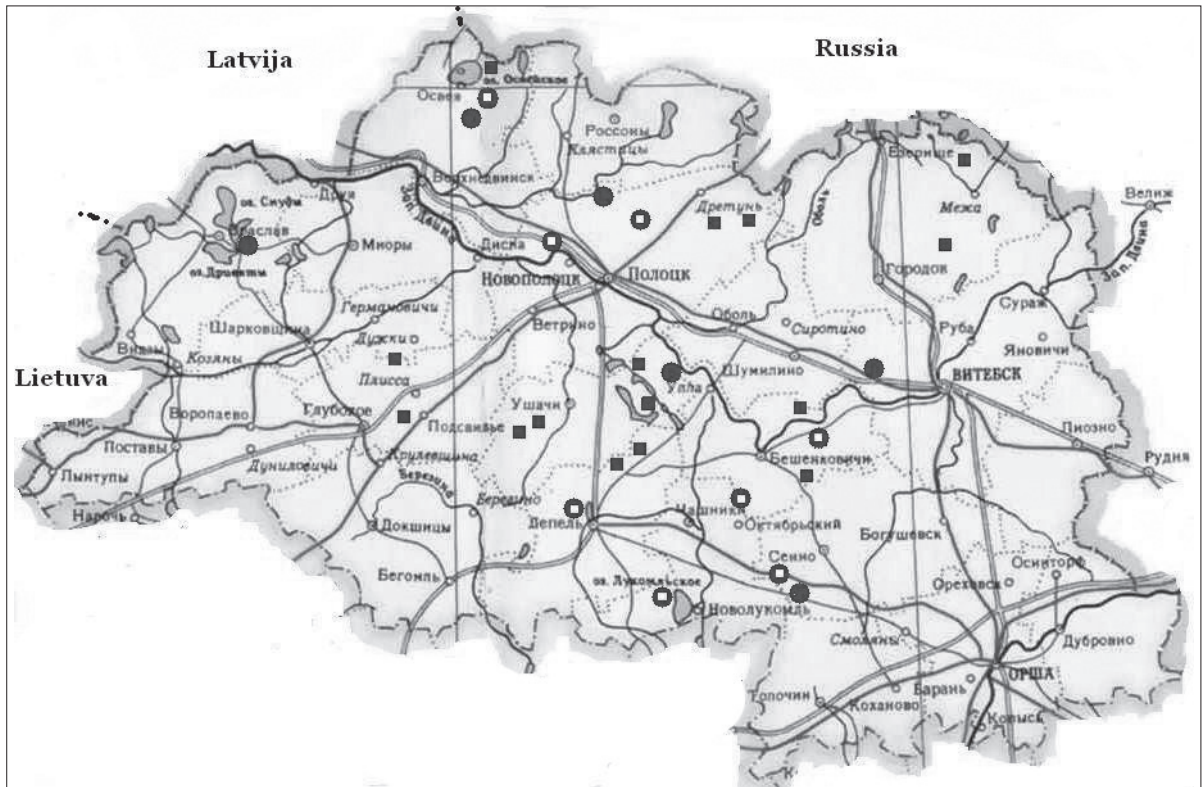
Fig. 1. The sacred lakes of the Dvina region (northwest Belarus): ● lakes called Sacred (Святыя озёра); ■ bodies of water to which place-legends relating to a church sunken in the lake are related; ○ lakes called Sacred (Святыя озёра) to which place-legends about a church sunken in the lake are related (compiled by the author).