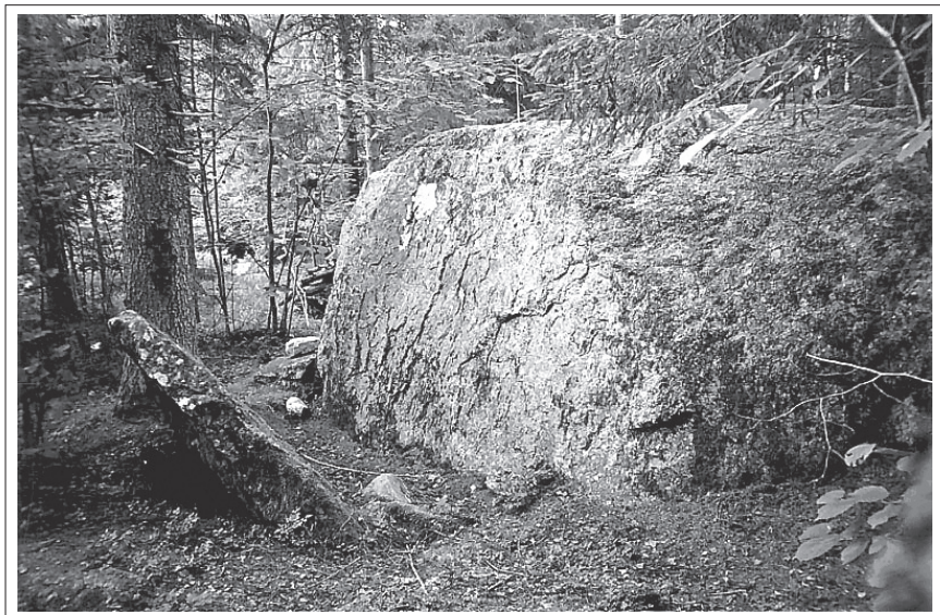
Fig. 5. Mērsrags Holy Maid stone.

Stones near which female mythical creatures spin, knit and sew should be considered unique, due to the small number of them. In Latvia, only in relation to Mērsrags holy maid-stone (Fig. 5, 6) is there a set of legends that describe a sacred woman spinning, or a drone of yarn cart is heard in this stone. At midnight, a sacred woman used to come out and spin flax (LFK 924, 3)