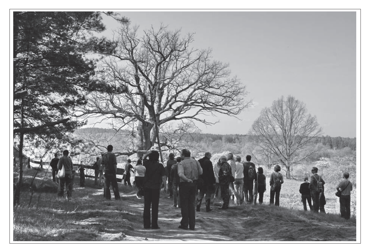
The excursion to the sacred oak tree of Ardiškis (in the Širvintos district).