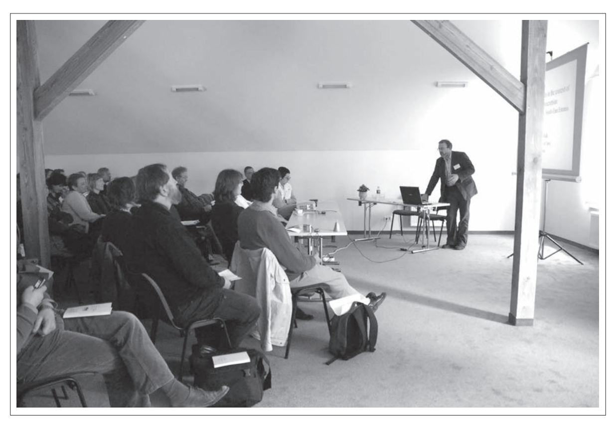
A moment during the conference in Kernavė.

The 15 reports presented at the conference and two further reports made available on stands covered the northern, eastern and southern parts of the Baltic Sea region: Finland, Estonia, Russia, Latvia, Lithuania, Belarus, Poland and Germany. Participants accepted the term 'natural holy places' as a working term for the conference, covering all and any holy or cult places in the natural world (such as rocks, stones, trees, water bodies), which are normally of natural origin. Rock carvings and cup-marked stones found in Finland represented perhaps the oldest period, the Stone Age and the Bronze Age, whereas stones with sharp-bottomed