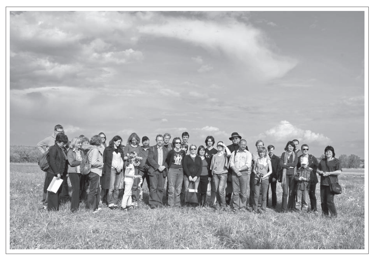
The excursion to the site of the Kukaveitis sacred grove.