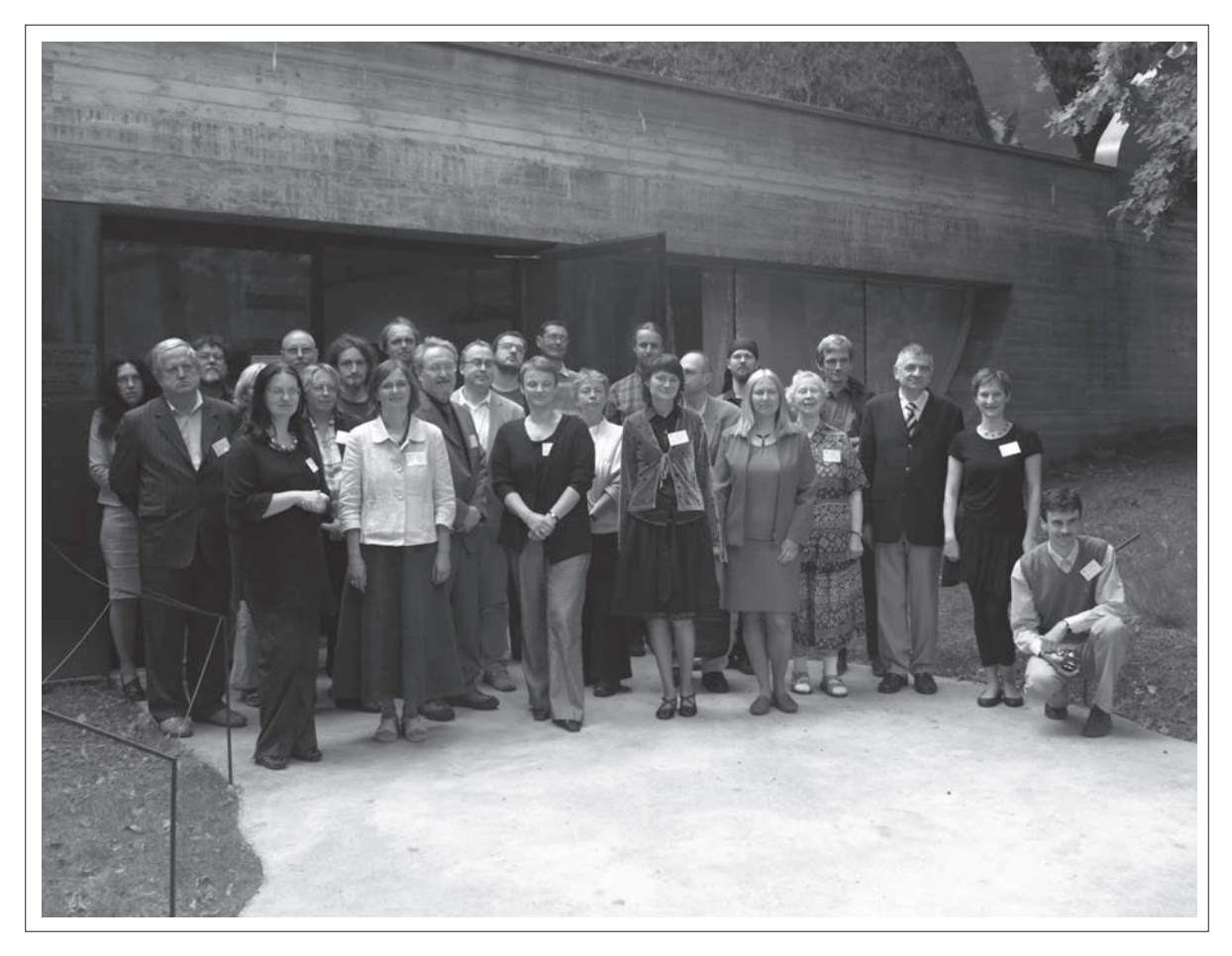
At the Centre of Europe Open Air Museum conference hall.

Another important task is to study the Baltic worldview as a cultural phenomenon manifested in different forms (such as folklore, language, religion and mythology), and to bring together researchers from different fields. This is also very relevant, especially in view of