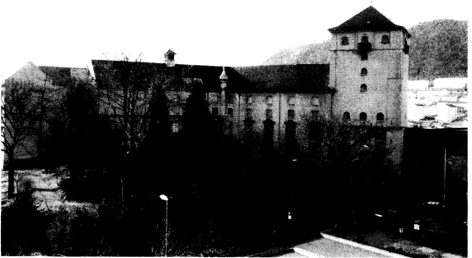
Fig. 2. Historical Museum

addition to their ordinary research and education activities: Archaeology, Cultural Studies and Art History, Social Anthropology, Geology, Botany and Zoology.