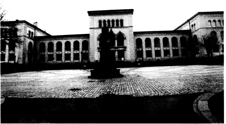
Fig. 1. Natural History Museum