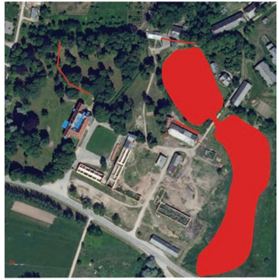
— excavations — surveillance