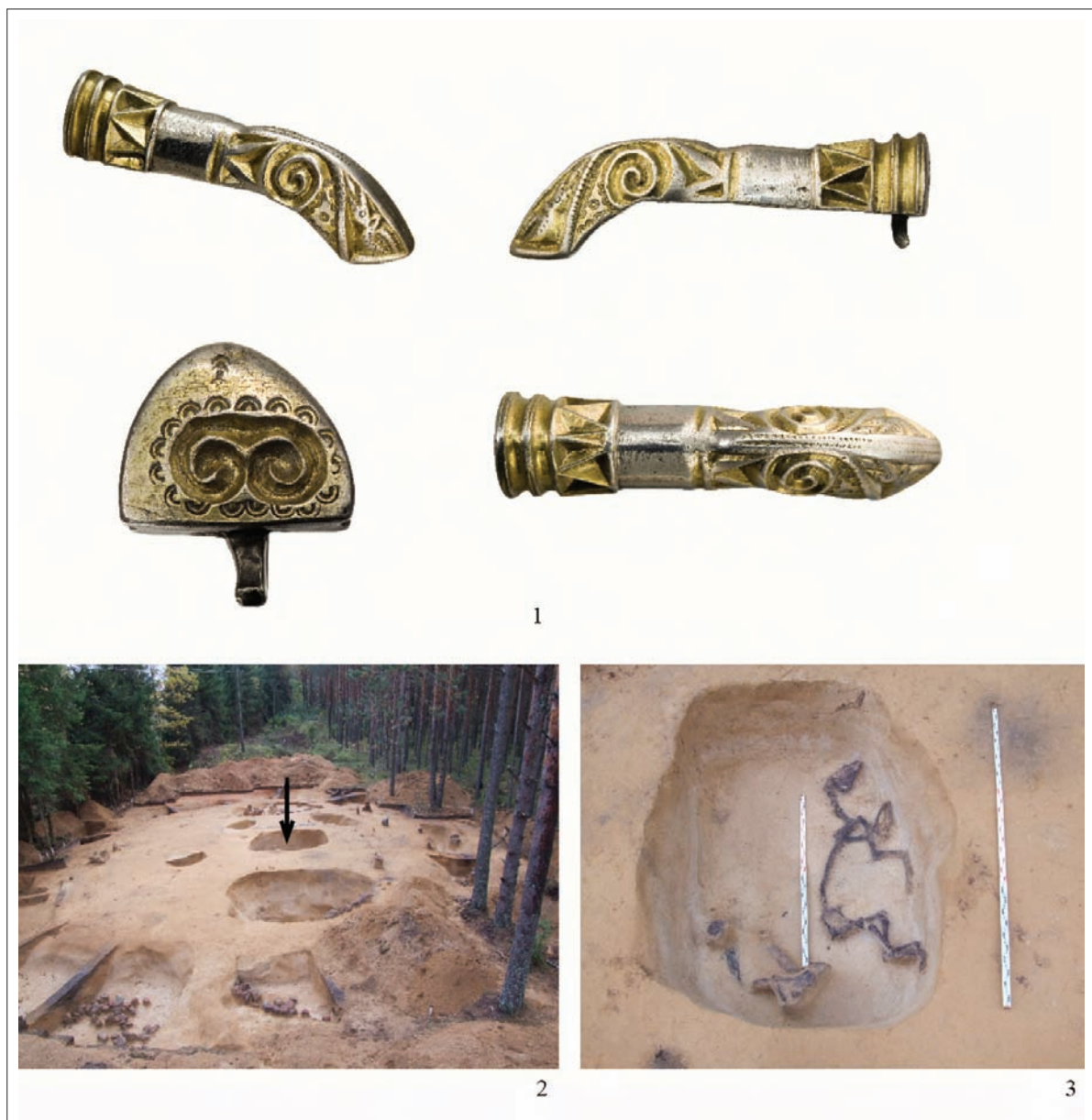
Plate V 1 Paduobė-Šaltaliūnė barrow no. 17, tongue of a belt buckle (length 7.4 cm gilded silver); 2 barrow no. 17 during excavations; 3 barrow no. 17: horseman and his horse grave in situ (curated at the Lithuanian National Museum in Vilnius).