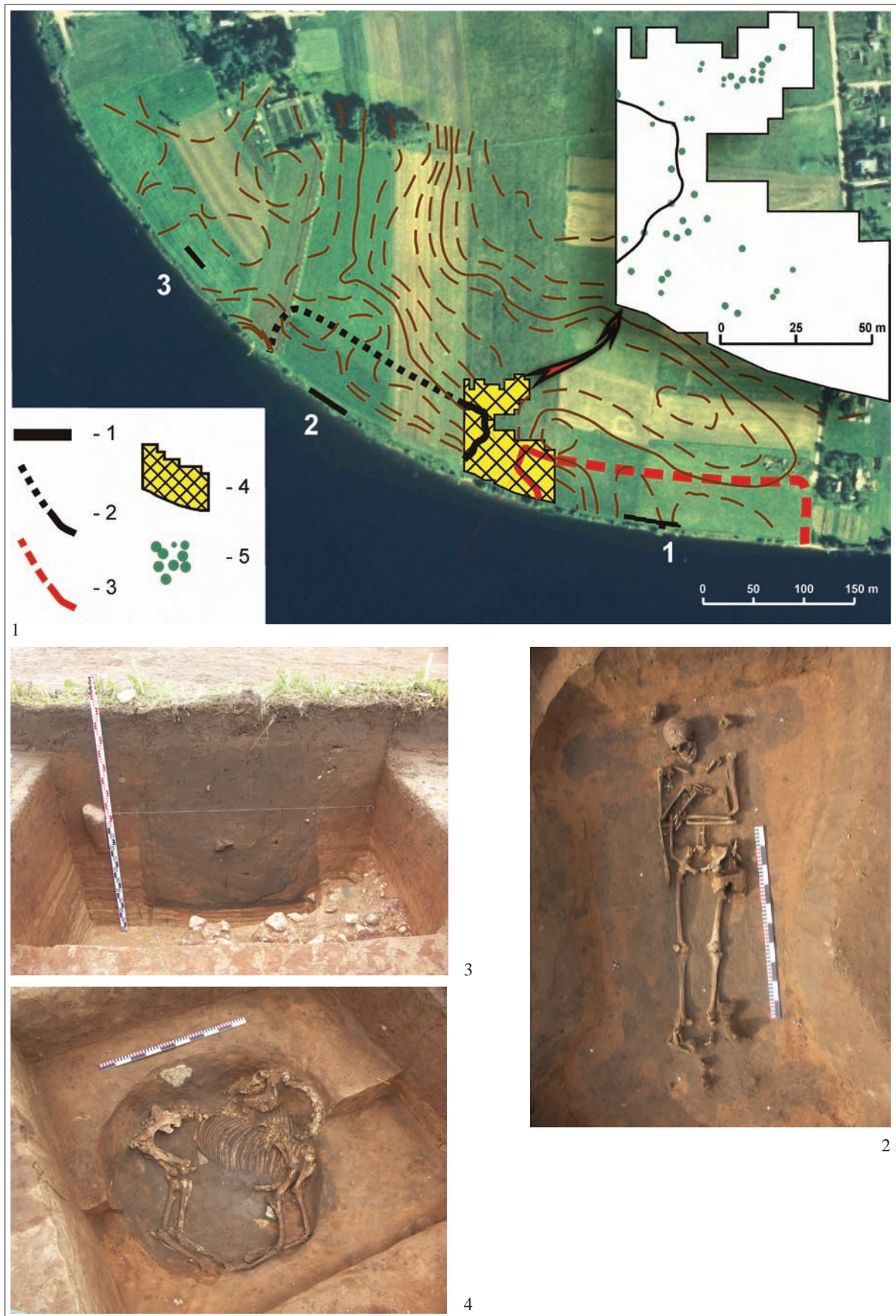
Plate VI Archaeological complex at Ogresgala Čabas: 1 Location plan of the complex of ancient sites at Ogresgala Čabas and the position of the ritual pits; 2 Grave 10; 3 Cross-section of a ritual pit (Feature 75); 4 The horse sacrifice from Ogresgala Čabas.