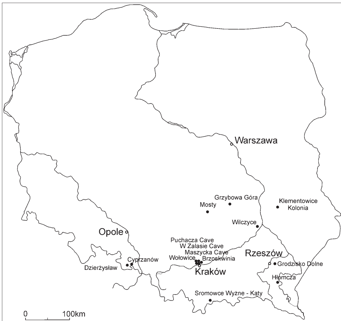
Fig. 1. Magdalenian sites in Poland

A different situation can be observed at the Alleröd site in Grzybowa Góra (Rydno II/59). Only about 20% of the inventory was made of “chocolate” flint, of which bassets can be found about 20 kilometres to the north-east; most of the artefacts were made of local-Kraków Jurassic flint, of which deposits can be found up to a distance of over 100 kilometres to the south (Schild 1965; Kozłowski 1987). These two kinds of flint were used willingly also in Mosty, located close to Grzybowa Góra (Cyrek 1986), but here “chocolate” flint predominates over Jurassic (61.5% and 36.6% respectively).