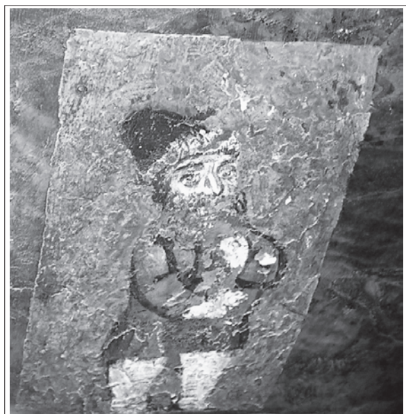
Fig. 2. A extant fragment of a polychromatic painting on the scoop.

informative as they consist only of depictions of vegetables. Some hope remains of eventually discovering the contents of the former Christian painting, because the restoration took place in 1956 and 1968 when it was customary to keep a full photographic record. This documentation must have survived somewhere.