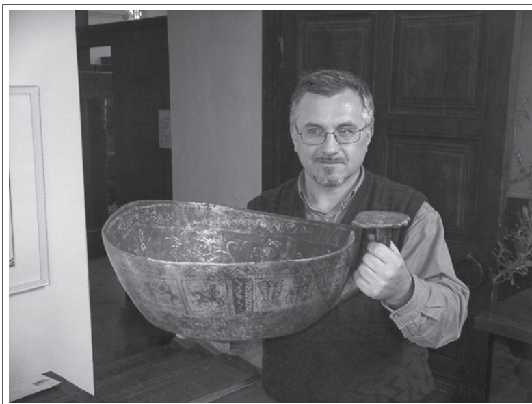
Fig. 1. The ancient ritual scoop being held by the author (Raubichi Folk Arts and Crafts Museum, Byelorussia, 2007).

Up until now there have been a lot of unanswered questions concerning the circumstances and details both of the discovery of the scoop and of its restoration. It is essential to know what scenes were depicted in the polychromatic painting. Only a small fragment of one of these paintings has been preserved near the handle on the outer surface of the scoop (Fig. 2). We see a bearded man wearing a big conical fur cap and looking as if he is holding a baby in his arms. It might represent a baptismal scene, in which case the complete decoration may have represented the whole ritual of baptism. This is very probable, taking in account that the scoop was used in the church for baptismal purposes. There are also polychromatic paintings preserved on the inner side of the scoop, but unfortunately these are not