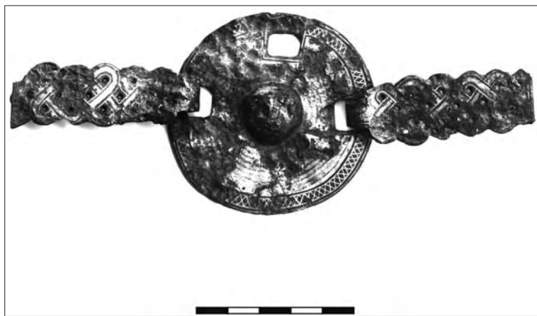
Fig. 2. 1 Sāraji grave 9. A horse's breast collar strap-divider with strap-ends (drawing by A. Ivbule, in the custody of LVM, No. A 12816: 121).

curled ends, while the rectangular strips of metal have notches or incisions along the sides.