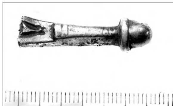
Fig. 3. One of the terminals of an East Baltic silver dress pin with a triangular-shaped head (scale 2:1;).