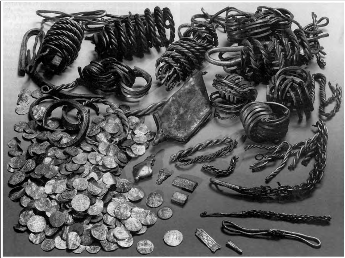
Fig. 1. The Ocksarve hoard of 1997 (in the custody of the Statens Historiska Museum 33128), now exhibited in Gotlands fornsal, Visby.