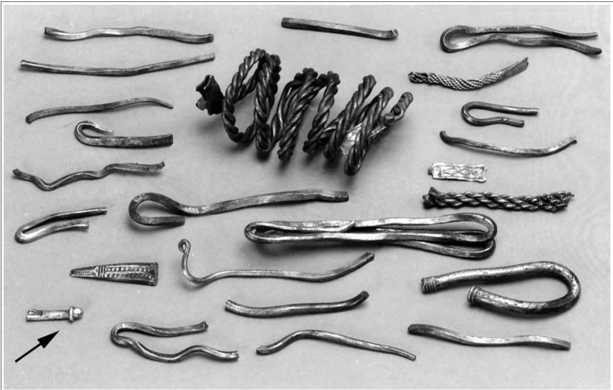
Fig. 2. The heaviest silver bundle from Ocksarve when opened.