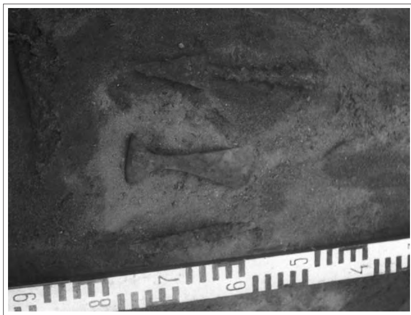
Fig. 3. Grigiškės–Neravai barrow 18 symbolic burial 3 in situ (photograph by O. Kuncienė, 1975).

was surrounded by ditches, also contained another cremation burial.