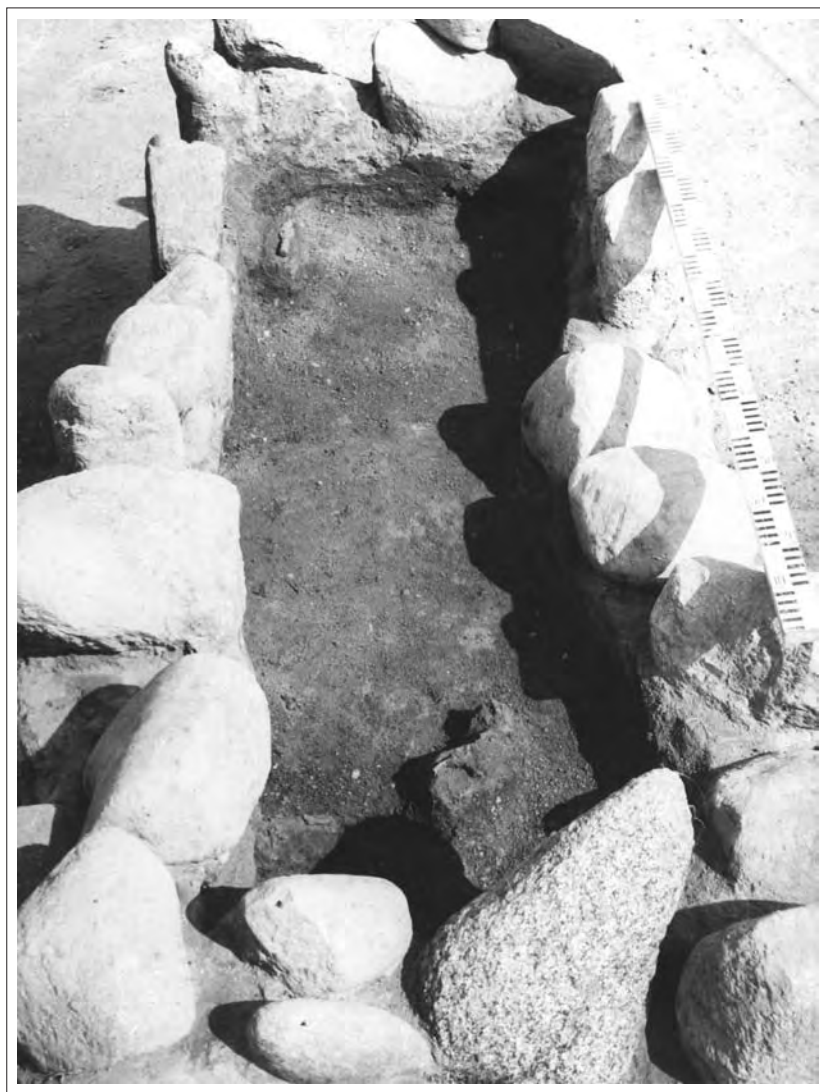
Fig. 2. Eitulionys barrow 1 symbolic burial in situ.