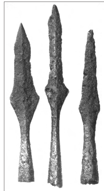
Fig. 3. Spearheads with pronounced shoulders on the blade from Jauneikiai (Joniškis district) cemetery grave 431 and Degėšiai (Pakruojis district) stray find (length from 21cm to 24cm; after The Semigallians 2005, nos. 611-613).

As has already been mentioned, the majority, ie about 80%, of all the males were buried with spears. This weapon was the most common and democratic. All of the community's males, including the children, had spearheads. Presumably it is not the presence of spears, but rather their number that enables us to speak about a male's social status in the community. It would, incidentally, be appropriate to note here that if more than one spear is present, the spearhead blades can be diverse, ie of different sizes and shapes. There are also