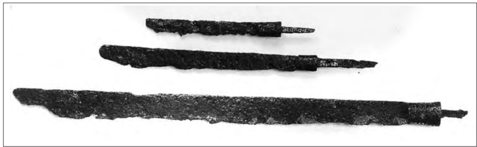
Fig. 5. Battle-knives with an iron hoop on the tang from Jauneikiai (Joniškis district), graves 371 and 431 (length from 16.7cm to 46.5cm; after The Semigallians 2005, nos. 640-642).

During the fifth to the seventh centuries, we find long, narrow battle knives, some of which still have iron hoops on the tangs, in the graves of Semigallian males (Fig. 5). Such battle knives had blades 17 to 47 centimetres long and 2.6 to three centimetres wide, while the hoops were cylindrical, 2.4 to three centimetres wide, and about 1.5 centimetres in diameter. The hoop was presumably necessary for binding the wooden hilts. The latter weapons are rare. In Lithuanian Semi-