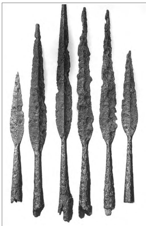
Fig. 1. Spearheads with narrow leaf-shaped blades belonging to a warrior from Šukioniai (Pakruojis district), grave 69 (length from 20.5cm to 29.1cm; after The Semigallians 2005, nos. 599-602).

Spearheads with a broad leaf-shaped blade of Kazakevičius type VI (1979, p.60) were the second most frequent at Semigallian sites (Fig. 2). They comprise from 27% to 44% of all the spearheads. Besides the Semigallians, the Samogitians, Curonians and Lettigallians also used such weapons. Such spearheads are found at their sites from the seventh to eighth centuries. In Semigallia, these spearheads were used as late as the 11th century. For example, at the Jauneikiai burial ground they are found together with crossbow brooches with poppyseed-shaped terminals, pins with ring heads, and massive and spiral bracelets. These graves date from the eighth to the 11th centuries. But later examples differ somewhat from the earlier classic ones, their blades being narrower and their sockets longer.