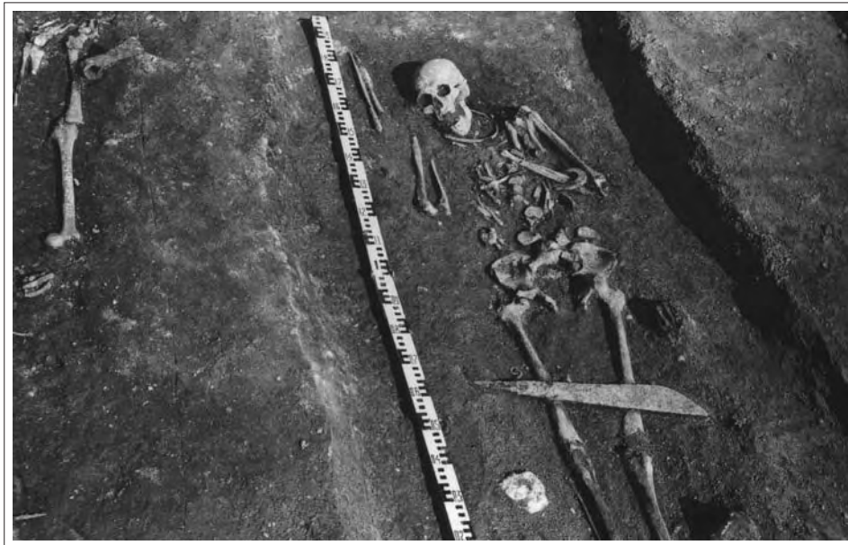
Fig. 8. Battle knives-swords in situ (Jauneikiai grave 113).