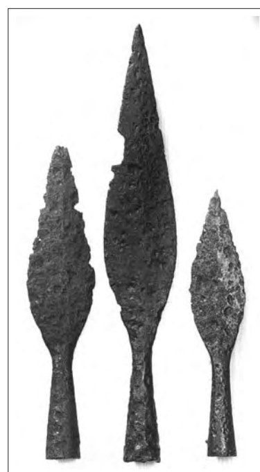
Fig. 2. Spearheads with broad leaf-shaped blades from Jauneikiai, Vaidžiūnai and Lieporai (Joniškis and Pasvalys districts) cemeteries (length from 20.5cm to 29.1cm; after The Semigallians 2005, nos. 599-602).