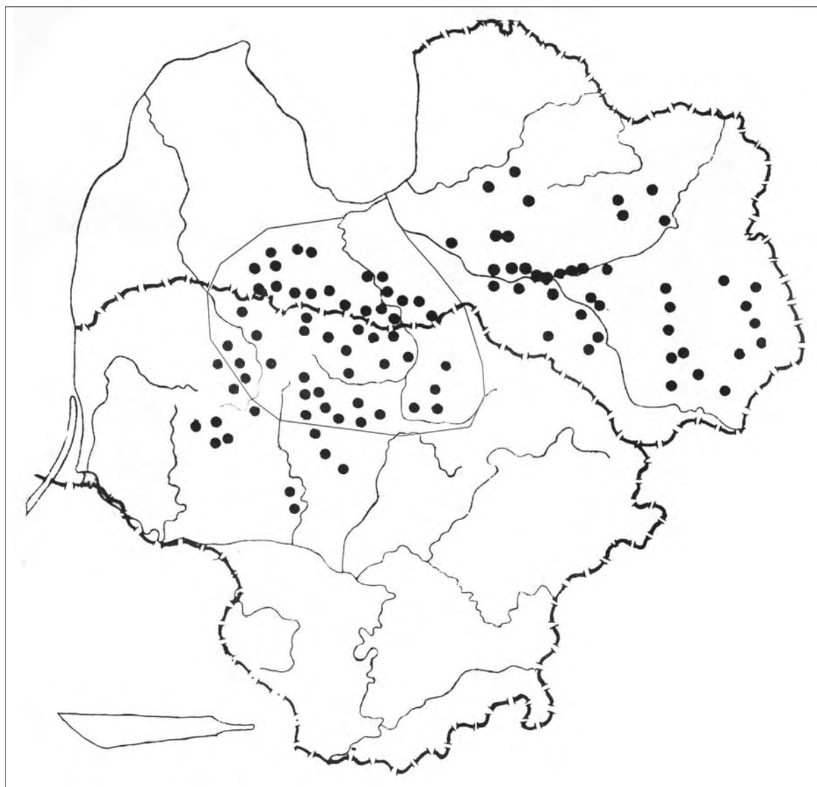
Fig. 7. Distribution of battle knives-swords in Semigallian territory (after Kazakevičius 1988, Fig. 44; supplement by the author).

scabbards, and were always placed in graves alongside the individual's skeleton.