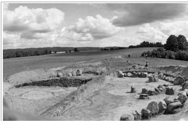
Fig. 1. The excavation of Taurapilis barrow 5 in 1970.

Nowadays, Taurapilis hill-fort has a 90-metre-long and 16-metre-wide trapezium-shaped plateau, and steep slopes 13 to 14 metres high. From inland it is surrounded by a ditch, which is 220 metres long, 25 metres wide and four metres deep. Beyond the ditch there is an open settlement. Based on stray finds (extensive excavations of the site have not been conducted yet), the hill-fort and the settlement have been dated back to