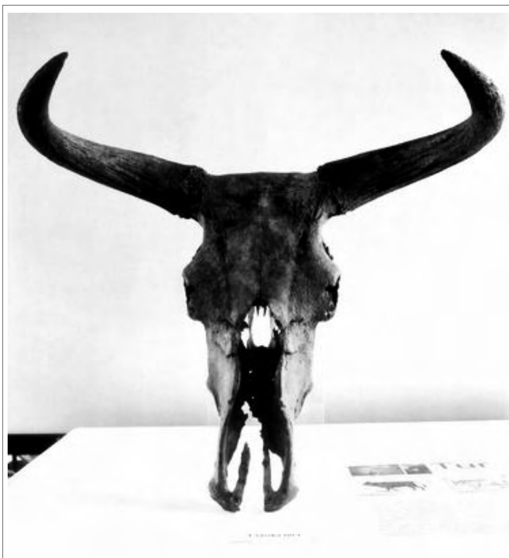
Fig. 3. A taurus ( Bos primigenius ) skull in the Museum of Wrocław University.

The grave of the Taurapilis “Duke” enables us to consider the complex of Taurapilis archaeological sites from the second half of the fifth and the sixth centuries (the hill-fort and barrows; Fig. 4) one of the Central Places of that period. I would like to note in this article that it can hardly be perceived without first identifying the mythological meaning of its surroundings. It is difficult to describe the site the way it used to be in the prehistoric period, but we have every reason to suppose that a taurus (bull) was the central mythological figure of this site.