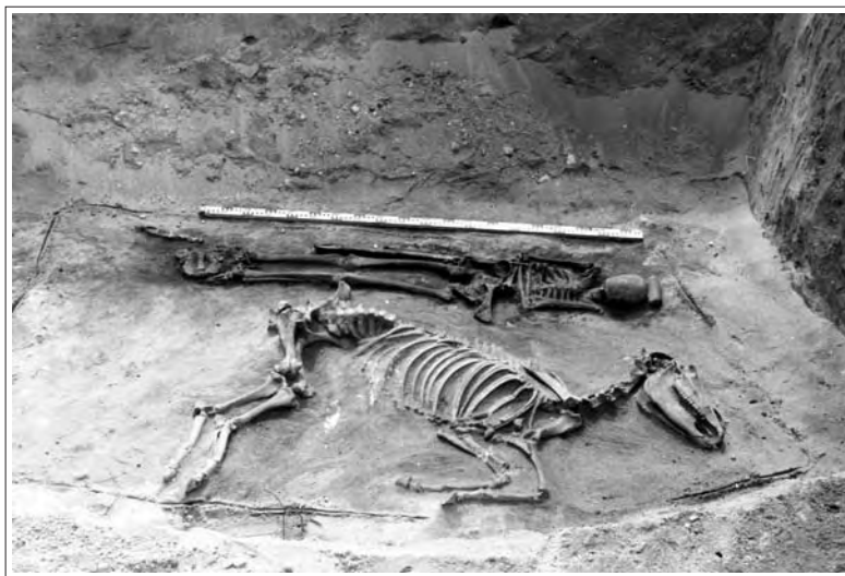
Fig. 2. The grave of Taurapilis barrow 5 (photograph by A. Tautavičius).

the first millennium AD and the first half of the second millennium (see Baubonis, Zabiela 2005, p.270).