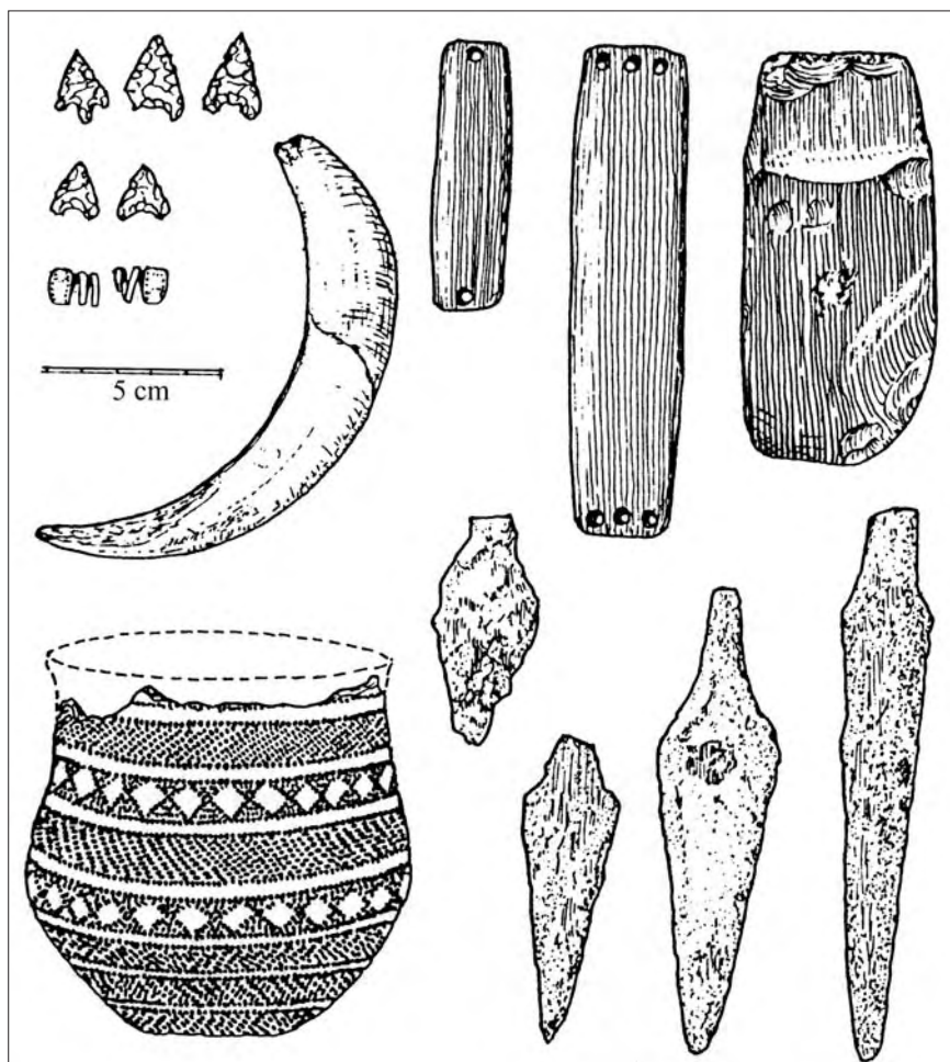
Fig. 2. The so-called “Beaker Package” from Předmosti (Moravia) (after Neolithikum, Fig. 96).

The same should be said about Early Bronze Age daggers. Although only their components were put into hoards, they were important components of these hoards. This is not a coincidence; on the contrary, it is an action connected with rituals. A symbolic meaning is attributed to the daggers mentioned. In archaeology it is called pars pro toto .