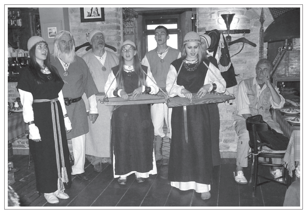
Ritual folk group "Kulgrinda"; Presentation of Baltic programme for conference participants.

question was raised: In what way can we, and, indeed, can we at all really reconstruct astronomical practices and cosmological knowledge using the limited facts that fall into our hands? A collection of abstracts of the conference's presentations were published as a separate publication before the conference (Vaitkevičius and Vaiškūnas 2007).