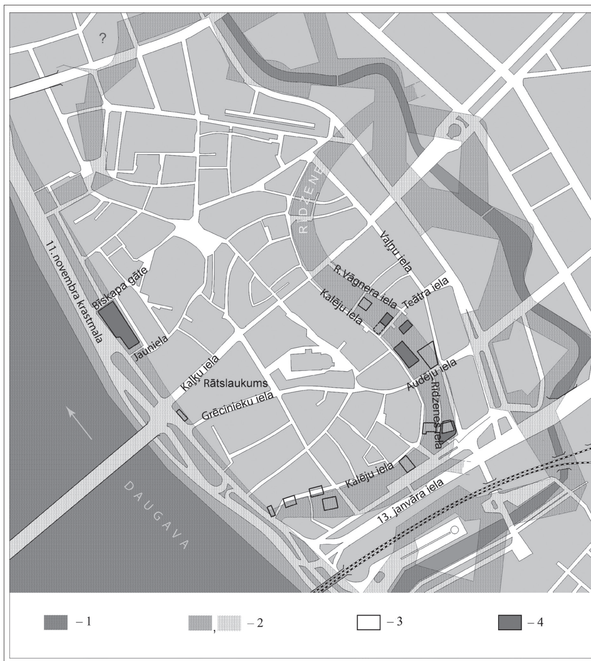
Fig. 1. Former watercourses and archaeological sites in Old Rīga where stretches of riverbank revetment have been discovered (after A. Caune 2007e, p.193 and M. Zunde): 1 present-day watercourses; 2 former watercourses; 3 excavation areas with stretches of riverbank revetment that have not been dendrochronologically dated; 4 excavation areas with dendrochronologically dated stretches of riverbank revetment.

bend in the River Rīga next to one of the Liv villages was used as a natural harbour (Caune 1994, p.32). Along this stretch of the river, immediately upstream of its inlet into the Daugava, the River Rīga flowed along the bed of a wider former channel. Here, the river, about 50 to 55 metres wide, and about four metres deep, offered protection from the wind and waves, as well as from the ice floes on the Daugava during the spring floods, and thus provided a very suitable harbour (Caune 1992, p.47ff.; 2007e, p.195). That this wider reach of the River Rīga was navigable is indicat-