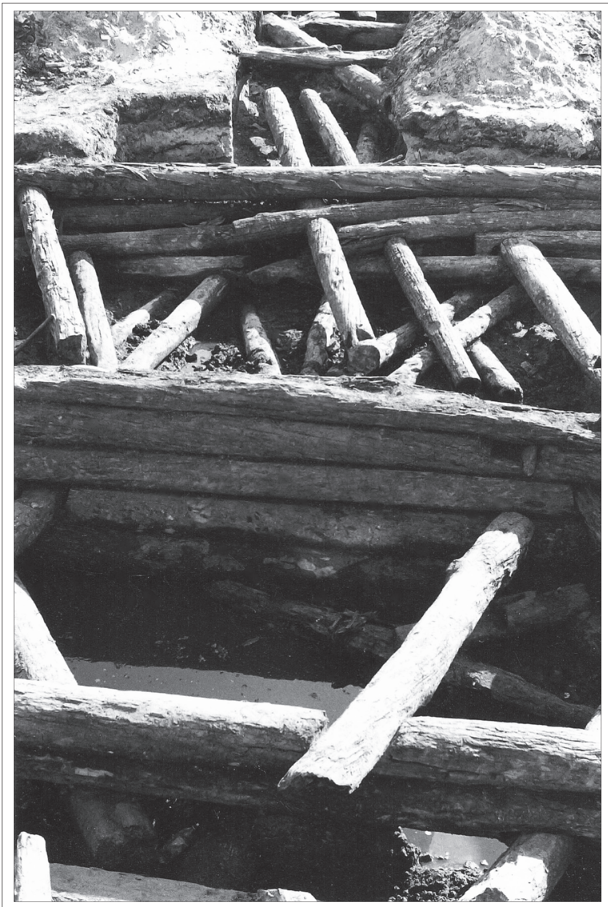
Fig. 2. A view of the stretches of right-bank revetments of the Daugava uncovered in 2000.