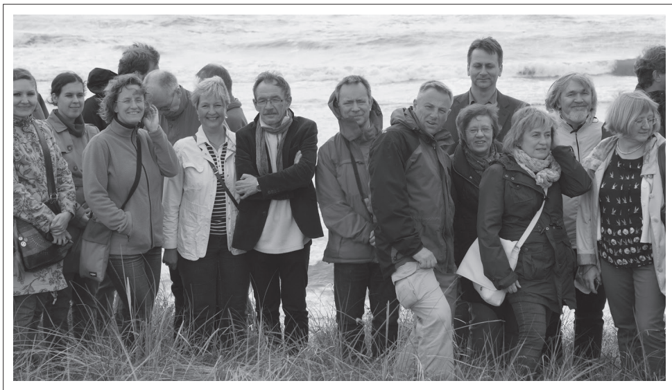
Figs. 2–4. Participants in the Nida Conference on 13 June 2014.